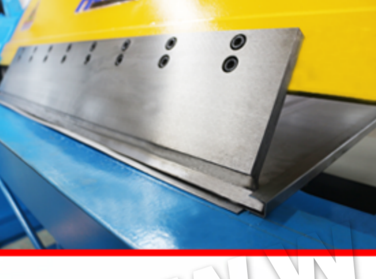
■ Folding Knife