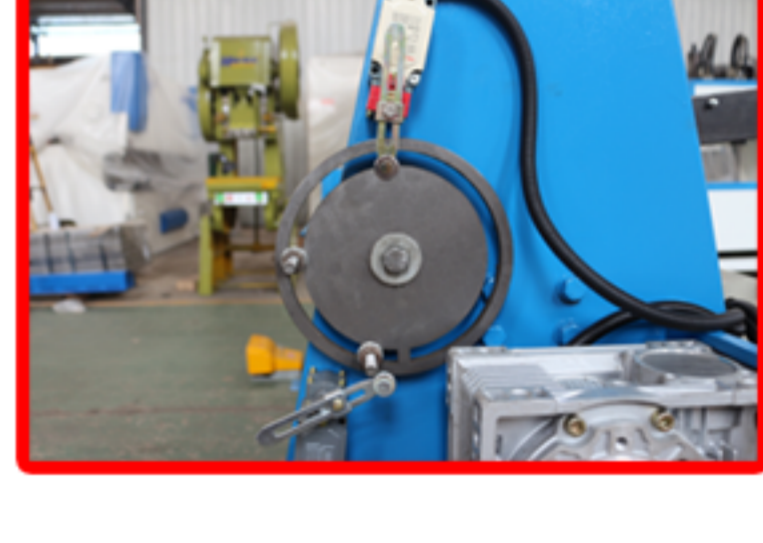
■ Angle Limit Adjustment