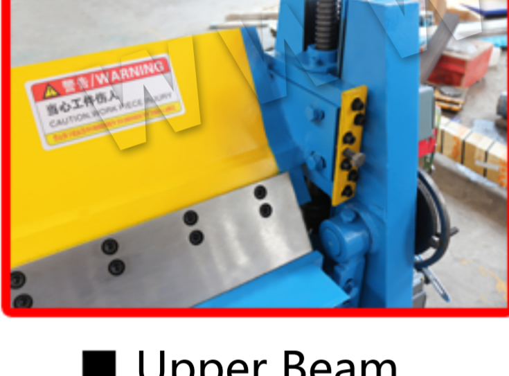
■ Upper Beam