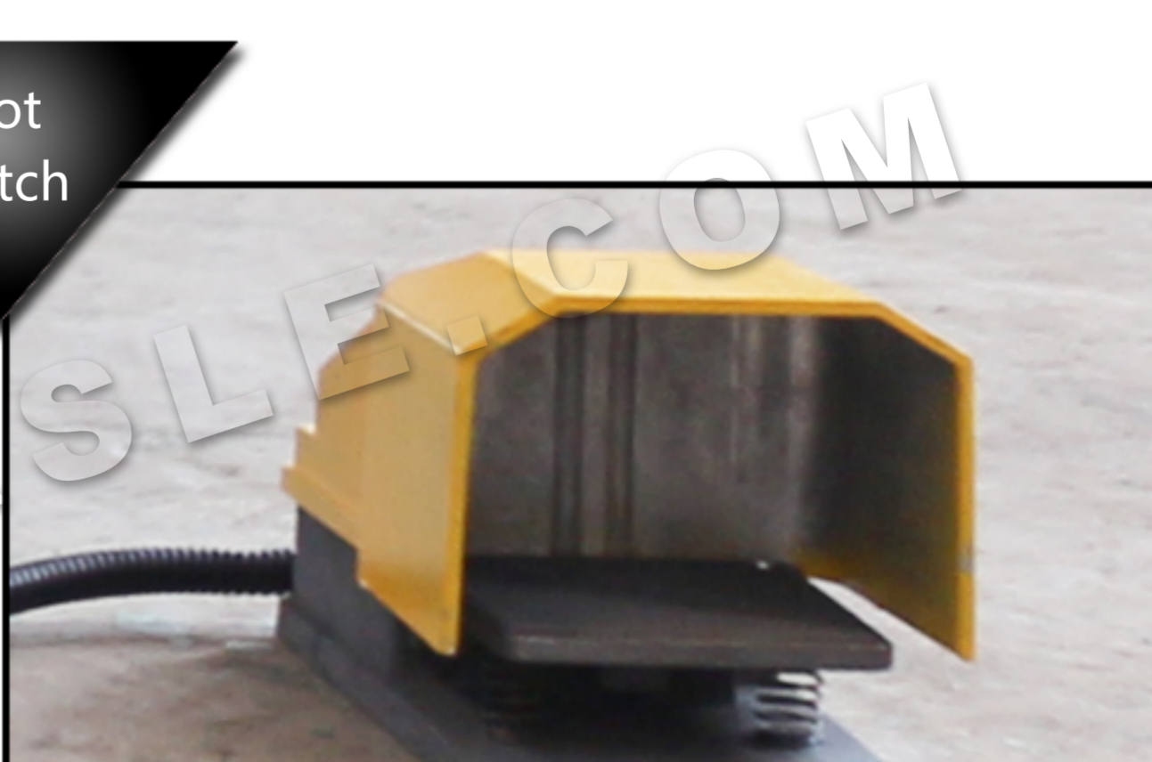
Bottom Beam Moving